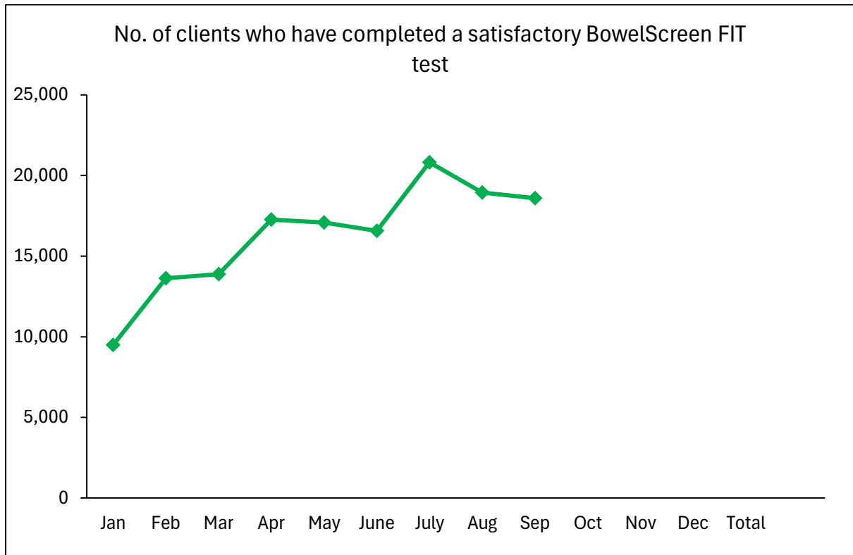
Table 1. No. of people who have completed a satisfactory BowelScreen FIT test by month 2025