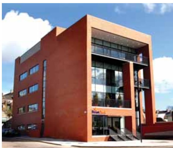
BreastCheck Southern Unit