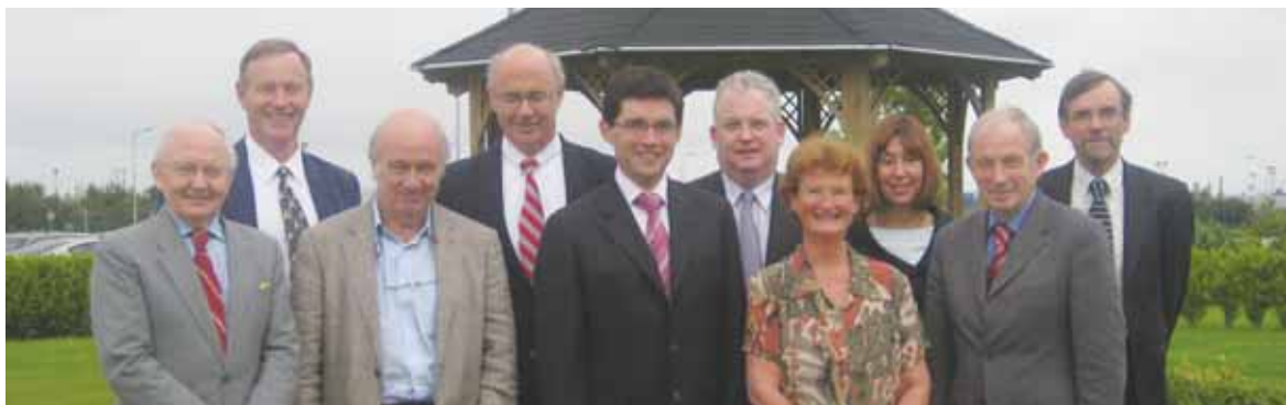
Members of the NCSS Expert Group on Colorectal Cancer Screening and the International Validation Panel