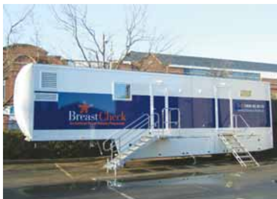
BreastCheck mobile digital screening unit

A fleet of eight mobile digital screening units have been commissioned to provide screening in broader counties. Four units will be attached to the BreastCheck Southern Unit, serving women in Cork, Kerry, Limerick, Waterford and Tipperary South and four will be attached to the BreastCheck Western Unit, providing screening to women in Clare, Donegal, Galway, Leitrim, Mayo, Roscommon, Sligo, Tipperary North.