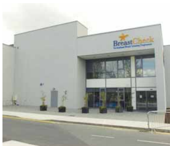
BreastCheck Western Unit