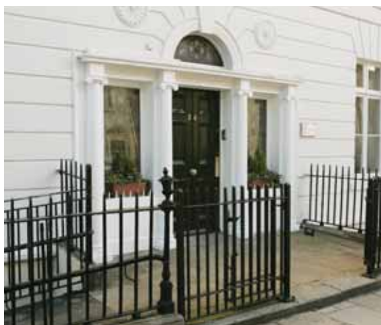
BreastCheck Eccles Unit