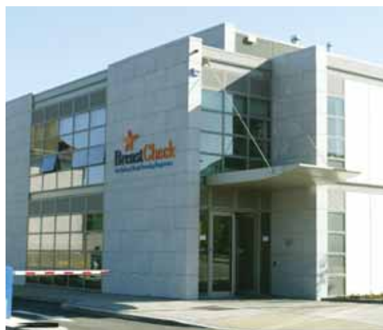
BreastCheck Merrion Unit