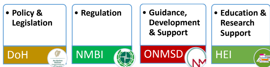
Figure 2. Partnership for the Development of Advanced Nursing or Midwifery Practitioner Services

The four partners involved in the development of advanced nursing or midwifery practitioner services are outlined below.